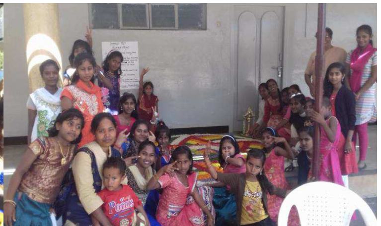
On the road for Onam celebration in Kerala