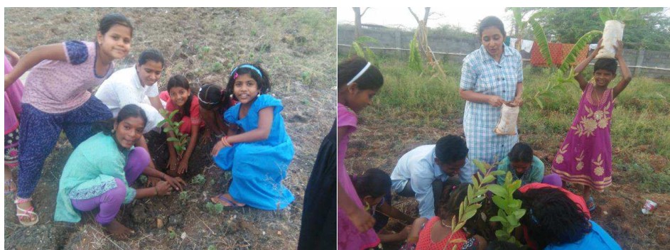
Plantation de jeunes arbustes

On 5th June, children and the staff celebrated the world environmental day by planting the saplings in the premises. On the occasion Sr Kuttiamma elaborated on the need to protect the environment and preserve it for the next generation.