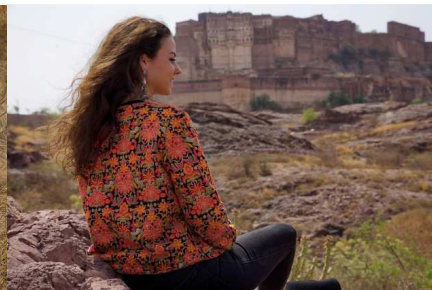
One modele of her collection