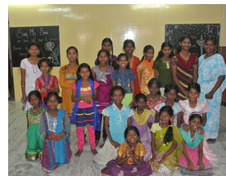
Right : House of Aruloli Pondichéry