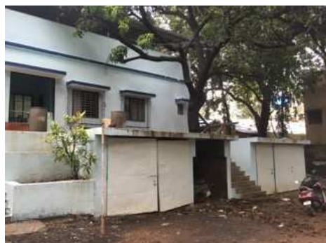
Before and after the works

a safety barrier on the terrace has been installed, allowing childrento play safely