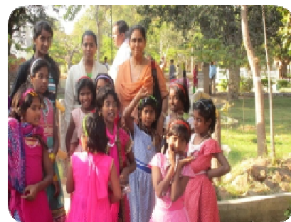
Girls of the Davangere home on their way to school, in the garden and in a park