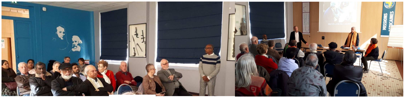
Photos of the A.G.M LYON.