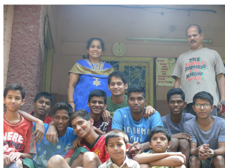
Left : House 4

- the institution itself : it promotes in the homes the education to moral values such as : availability, compromise, patience and above all a selfless attitude. The parents ensure they praise everyone and recognise the qualities of a child in front of the others, thus contributing to create a strong feeling of belonging to a community where, in full respect of individualities, life has a meaning.