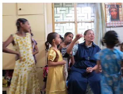
Right : House 16