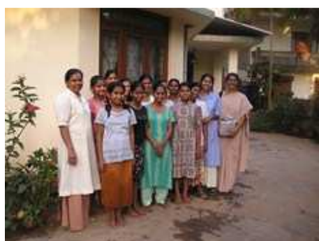
Left : House of Nuevem at Goa